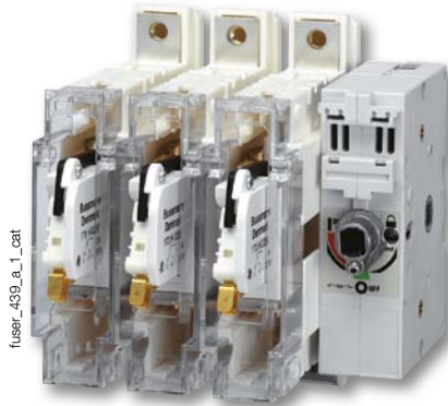
FUSERBLOC 630 to 1250 A